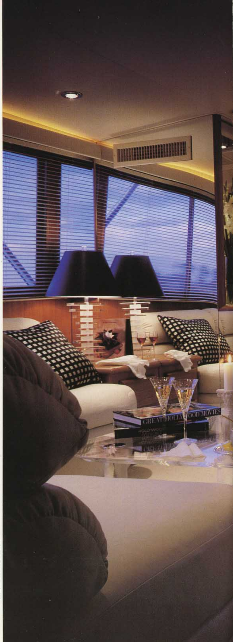
INTERIORS BY DAN FORER

In the saloon, the clear acrylic coffee table is optional—it matches the dinette table.